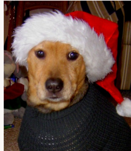
MY GIRL, LUCKY- IS UP FIRST- STAY TUNED FOR UPDATES!

I would add the pet's ashes to my paint and paper to create the special portrait. It would be called "Ashes to Art". What do you think? If you feel moved to send me your thoughts, I'd appreciate the feedback!